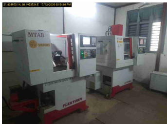
Image Geo Tag