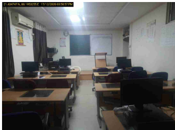
Image Geo Tag